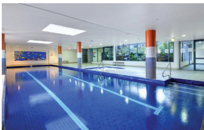
The indoor pool at Avanti Apartments

As the cost of gas increases on the Australian East Coast, the Air Change PoolPac Plus system offers an ideal solution to reduce energy running costs, minimise condensation and improve air quality in new pools and refurbishments.