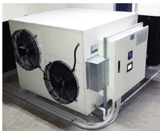
Air Change's PoolPac Plus installed in Avanti Apartments' plant room.