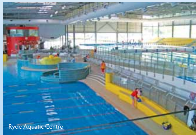
Ryde Aquatic Centre

The air distribution should be directed away from the pool surface to further reduce evaporation and instead should be supplied to effectively wash over any glass surfaces that are exposed to the outside environment.