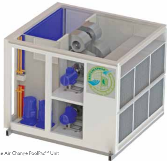
The Air Change PoolPac™ Unit

The indoor pool environment is also ideal for the growth of mould and mildew.