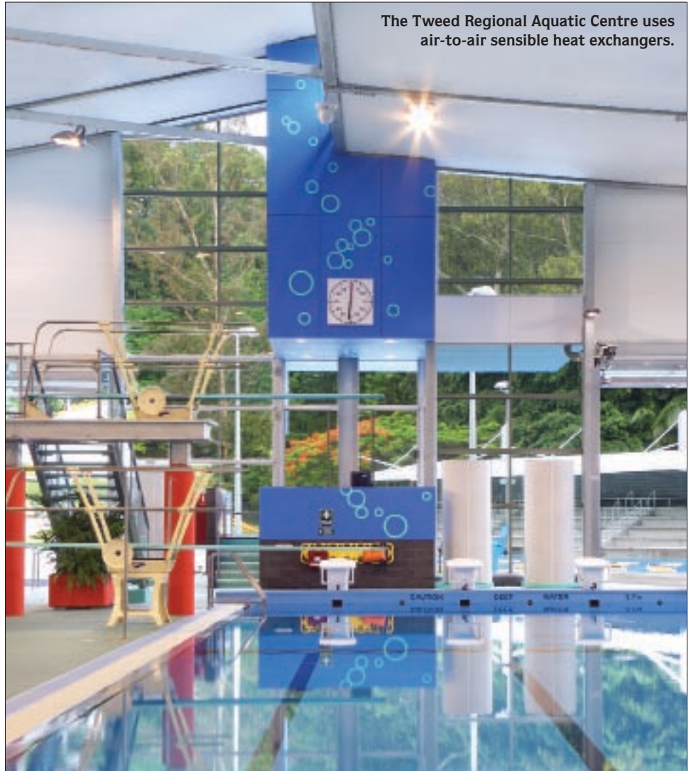
The Tweed Regional Aquatic Centre uses air-to-air sensible heat exchangers.